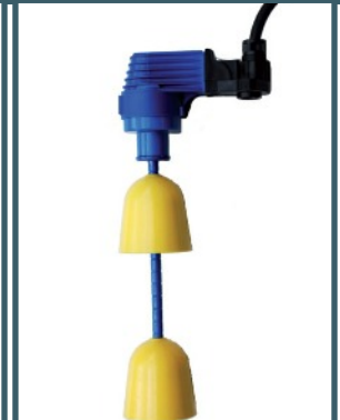
Agma W (waste water)