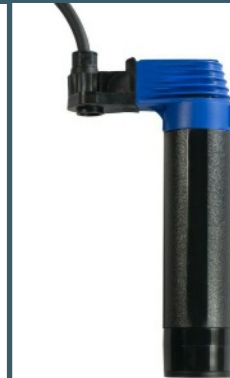
Agma 22 (clean water)

In stock in 250mm or 10m cable in PVC or H07RN-F with 3 cores. 2 core versions available by special order.